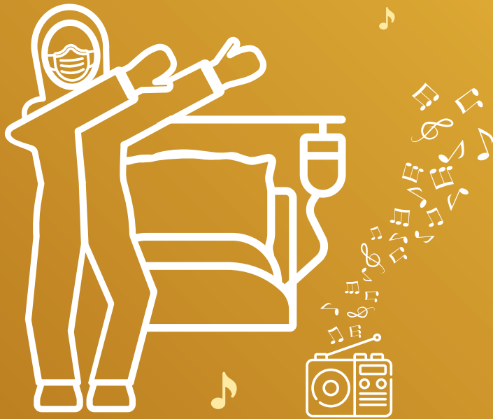
HOSPITALS TOOK PAINS TO RESPOND TO THE MENTAL HEALTH NEEDS OF PATIENTS

A social worker recounts, "We started to sing, do yoga, show films and engage patients. They had to have a positive outlook if they had to recover quickly. We also had to stay positive."